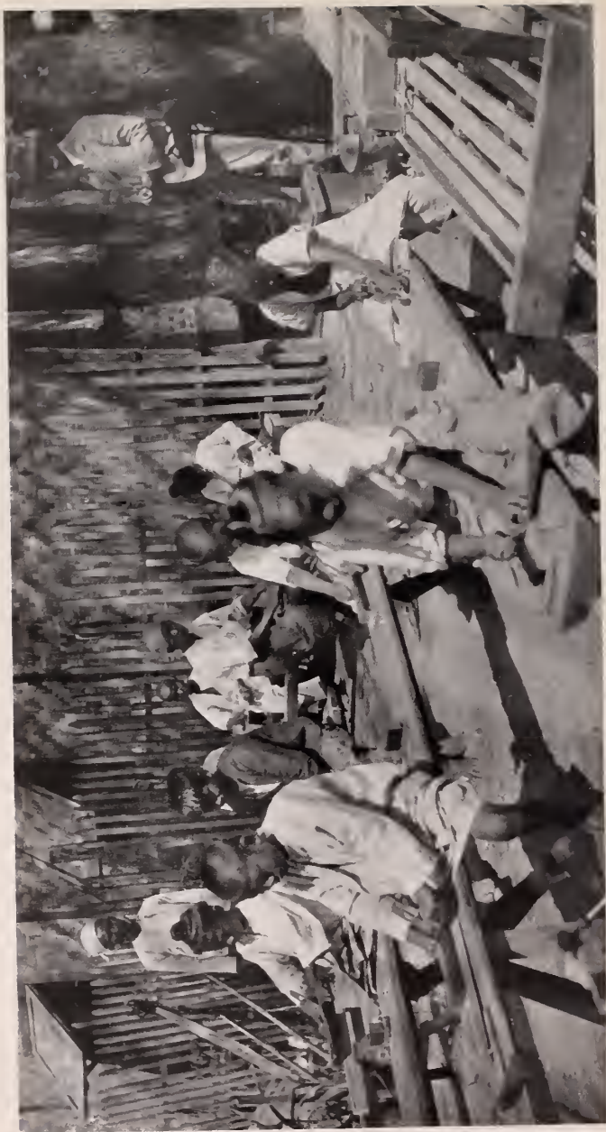
A manual-training class in the government industrial school in Mandalay